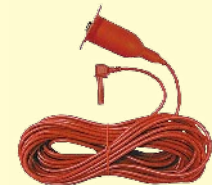
7253 Longer line probe with alligator clip(15m)