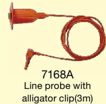
7168A Line probe with alligator clip(3m)