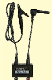
8302 Adapter for recorder (Output 1mV/1μA)